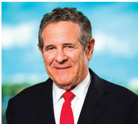
Dr. Arthur Agatston

The all-new keto-friendly program is based on Dr. Agatston's original best-selling South Beach Diet , published in 2003. The New Keto-Friendly South