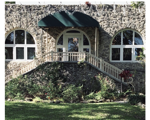
Dade Heritage Trust's 2020 Preservation Award winners will be honored during the nonprofit's Annual Meeting at the Woman's Club of Coconut Grove on April 2. To learn more visit www.dadeheritagetrust.com .

The Preservation Award winners will be honored during DHT's An-