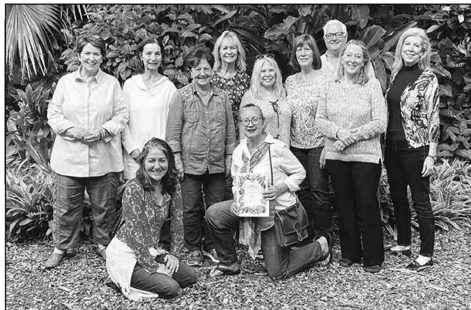
The Villagers 2020 Garden Tour Committee

Several of our historic South Florida Woman's Club clubhouses rely on rentals to preserve and maintain their beautiful buildings and support community outreach