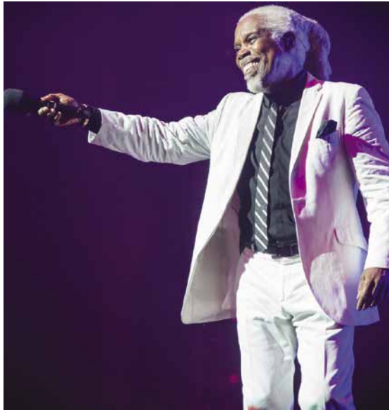
Billy Ocean

Trinidadian-born English “Loverboy” Billy Ocean will get the crowd “Calypso Crazy” with his hits “When The Going Gets Tough” and “Get Outta My Dreams, Get Into My Car.”